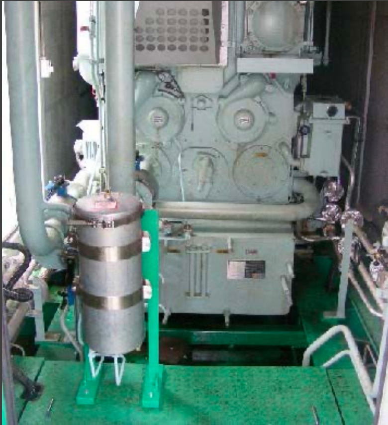
MOTOR HYUNDAI 9H21/32 400 gallons of water